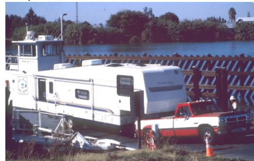
30' 5th wheel pulling off the Rio Vista Ferry onto Ryer Island at high tides.

RENTAL CABINS or "SNUGGLE INNS": Prices range from $100 to $565 per night , depending on the number of persons and the size of the Snuggle Inn. Choose from large waterfront homes that sleep 14+ or smaller waterfront cottages for 4-8 persons. No Smoking allowed, but pets are allowed in designated cottages.