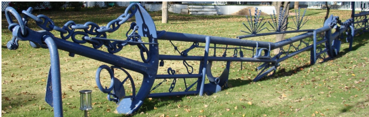
Soldered to the Golden Gate Railings: Anchor, turnbuckle, bear trap, small boat prop, skeleton key, various cleats, wrenches, chain, corkscrew drillbits, key holder, sailboat hardware, snap close,...this is just one of 5 large sections found around the park!